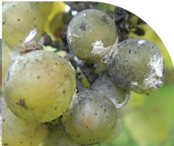
Mealybugs on grapes