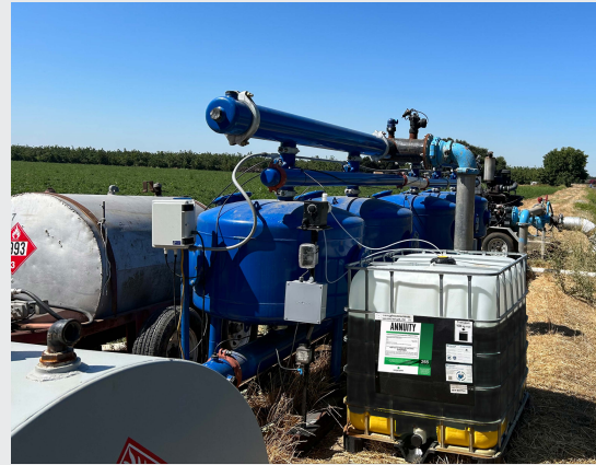
240 GALS LIQUID ANNUITY