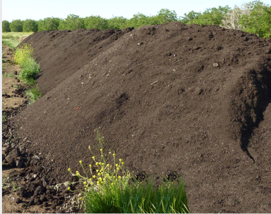
240 TONS BULK COMPOST/MANURE

Results in 0.5 - 1lb of soluble humus per ton for soil amending benefits