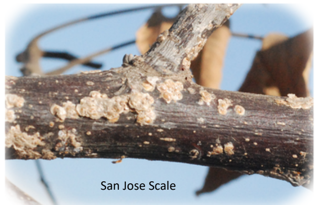
San Jose Scale

Due to the Active Ingredient (AI) Buprofezin and unique mode of action, Odeza™ provides excellent control of San Jose scale, controls pear psylla and mealybugs, and is very effective on soft scales and leafhoppers. It also benefits all Integrated Pest Management (IPM) and Resistance Management programs.