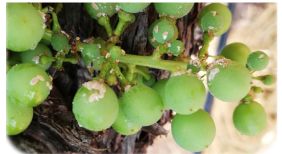
Vine Mealybug on grapes

Key crops: coffee, grape, olive, Persimmon, pomegranate and tropical fruits.