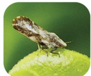
Asian Citrus Psyllid